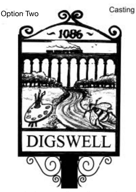
Full descriptions and installation diagrams are on our web site www.digswellra.org.uk